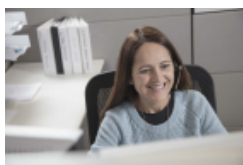
International Customer Service