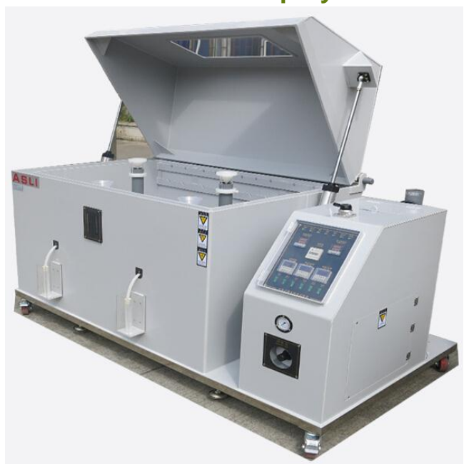
Sulfur Dioxide Spray Chamber