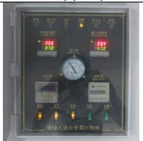
Continuous Spray control panel