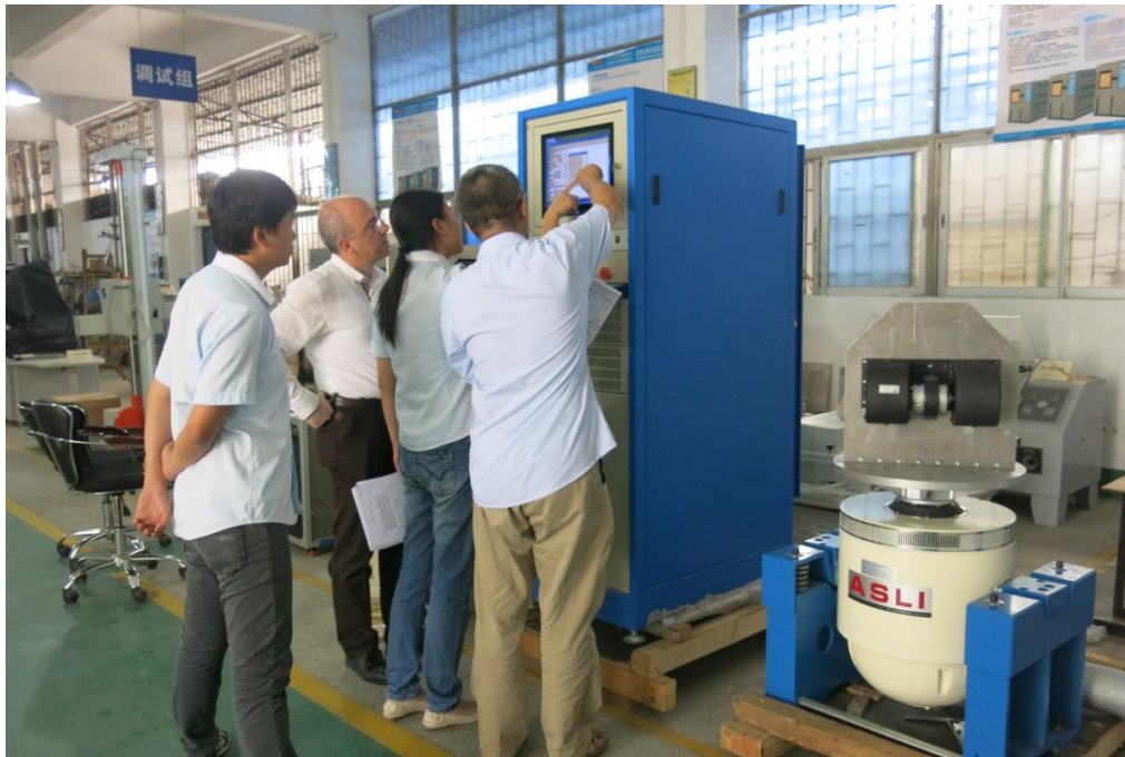
(Customer training in ASLi factory)