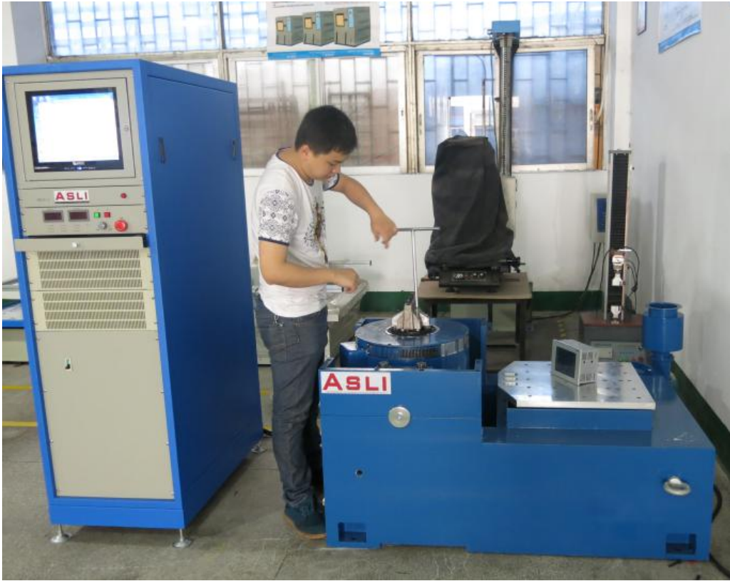
(Whole Set Vibration Shaker : Vertical +Horizontal )