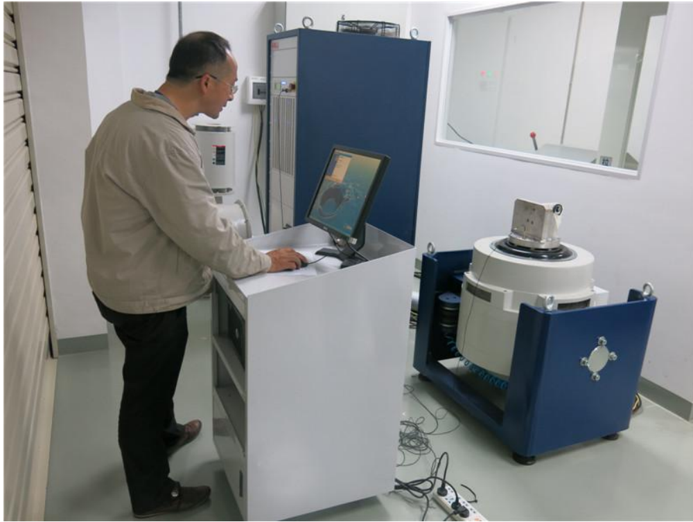
(ASLi Vibration tester in customer's Lab.)