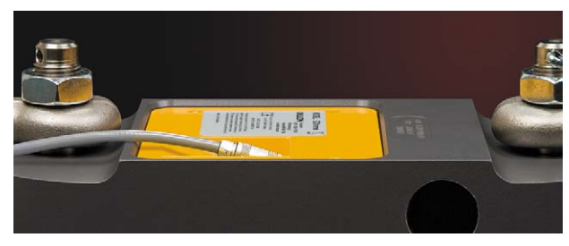
Small details improve durability. The EDX treme features a recessed connector and embedded antenna to help prevent damage from snags that commonly disable other instruments.