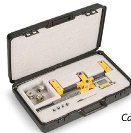
Carrying case included

Dillon also manufactures highly accurate tensiometers, mechanical dynamometers and crane scales.