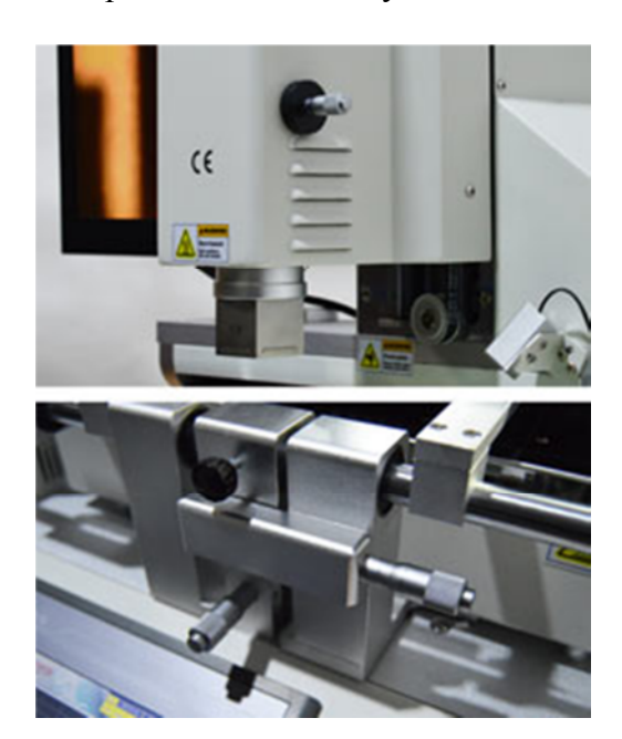
High-Precision X, Y, and \theta -Axes Alignment Micrometers

Another of the RW1210's Manncorp-exclusive features is the superior quality of its 1.3 million pixel, split-vision CCD camera and 15" 1080p LCD display with HDMI input. 230x joystick-controlled zoom, and independent adjustment of high-brightness LED lighting for the component and PCB, allow ultra-clear, superimposed views of component leads and PCB solder pads. The RW1210 is the only rework system in its price range to include true high-definition vision that is on a par with the industry's most advanced, high-end rework systems.