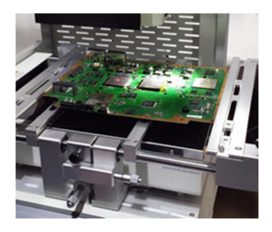
Versatile PCB Holder Accommodates Wide Range of Boards

The RW1210's user-friendly touchscreen control software is just one of many Manncorp-exclusive features that set it apart from other rework systems in its class. An ergonomically-designed instrument panel includes joystick control for both the alignment camera zoom and the up/down motion of the upper heater/placement head when in the manual mode. Dial adjustments are conveniently located for component and PCB lighting, as well as control of the upper heater hot air flow to prevent shifting of small chip components during reflow. The control panel also includes a built-in K-type thermocouple input and USB port for exporting temperature profiles to a flash drive.