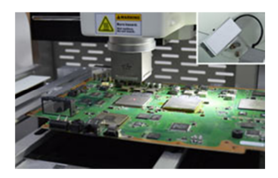
Easy PCB and Component Positioning with Convenient Laser Pointer

The RW1210's hot air bottom heater is surrounded by a 2700W, 350 mm x 250 mm (13.75" x 10") "Rapid IR" underheater that quickly and efficiently heats the bottom surface of the PCB. Raising the temperature of the entire board prevents board warpage and reduces stress on components and solder joints adjacent to the rework site. It also reduces overall cycle times and maximum temperature exposure. For operator safety and reduced maintenance, the infrared heaters are fully enclosed in a glass-shielded compartment that quickly dissipates heat, prevents debris from falling into the elements, and is easy to keep clean.