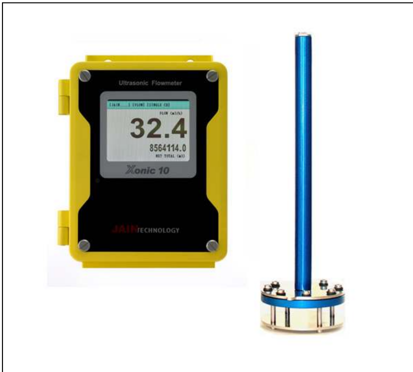
X10/2D use 2 pair transducers