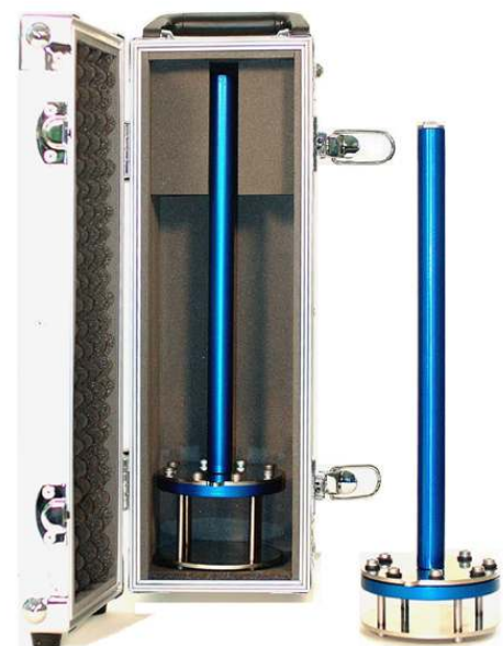
Durable Flow Cell and carry case