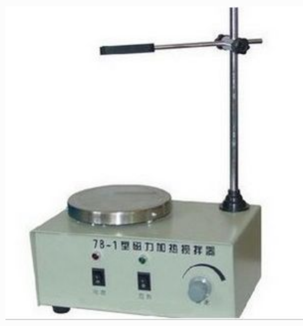
Magnetic heated stirrer with Temperature digital display TOB-MS-85-2