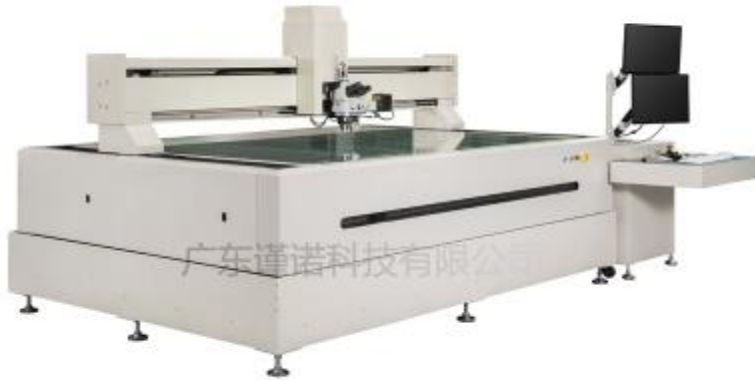
Automatic tool metallographic measuring instrument V800