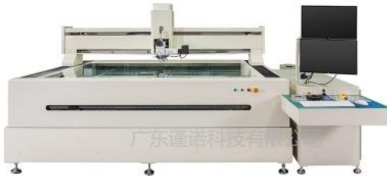
Automatic tool metallographic measuring instrument V2000