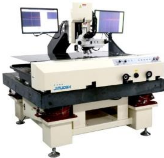
Automatic tool metallographic measuring instrument V400