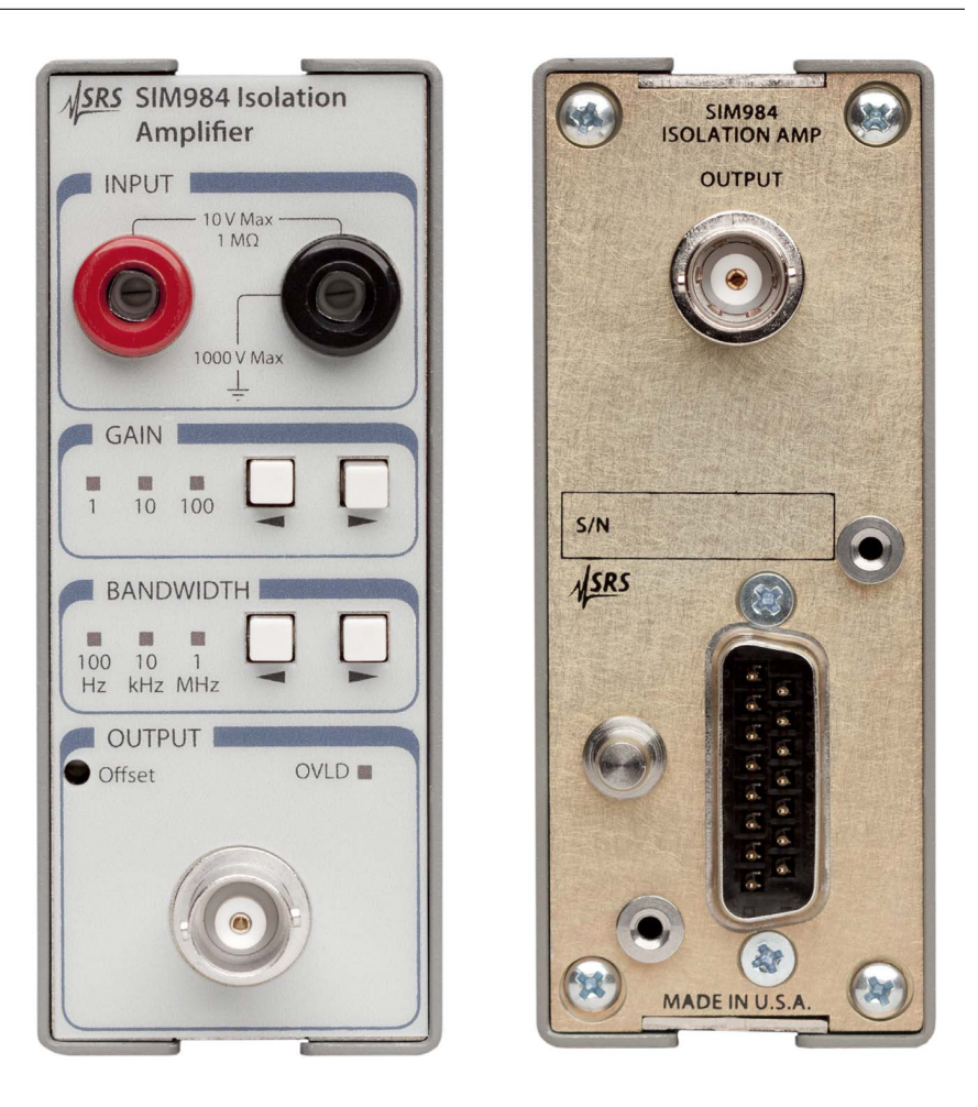
Figure 1.1: The SIM984 front and rear panels.